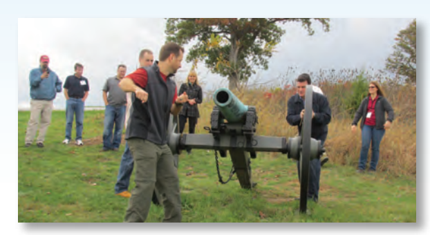
Federal employees participate in the cannon-drill team building exercise.

In the Footsteps of Leaders® can be tailored to the individual needs of your company or organization—from a one-day encounter on the battlefield to a three-day event that utilizes Gettysburg National Military Park, the Soldiers' National Cemetery, the town of Gettysburg and our state-of-the art Museum & Visitor Center.