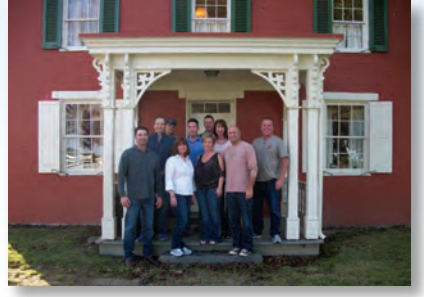
Team from Novo Nordisk visits the historic Sherfy House.

At Gettysburg Foundation, we have unique opportunities to facilitate the development of effective leaders through the use of America's most revered battlefield. The complexity of battle, the size of the opposing armies and the wide spectrum of personalities represented by the military leadership offer an extensive range of perspectives.