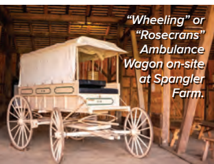
"Wheeling" or "Rosecrans" Ambulance Wagon on-site at Spangler Farm.